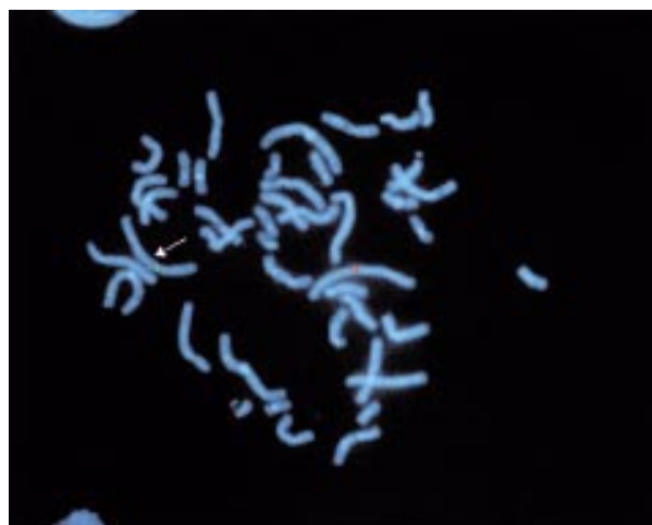
Figure 2 FISH metaphase with YAC 786a12 (red signal) and the alphoid chromosome 2 centromere probe (green signals). Hybridisation was absent on the deleted chromosome, as indicated by the white arrow.

Results showed that both proximal 2q14 YACs 786a12 and 817b4 were deleted from the abnormal chromosome 2 (fig 2), while the distal 2q14 YACs 679d2 and 821h9 were retained. We conclude, therefore, that consistent with our findings from G banded analysis, the proximal region of 2q14 is absent. Hybridisation with the 2q13 YAC 791f4 produced a signal on both homologues, but one signal was frequently reduced in size. To confirm a partial deletion of this YAC, we carried out dual colour FISH in which YAC 791f4 was detected using texas red and one of the known deleted YACs with fluorescein (786a12). This showed that the reduced signal was consistently associated with the deleted homologue (fig 3). Semiquantitative FISH 5 in a series of 10 cells showed that the signal from the partially deleted YAC was only 0.48 times (95% CI 0.32-0.72) that