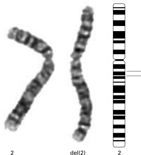
Figure 1 Chromosome 2 with deletion indicated by bracket. G banded partial karyotype (left) and ideogram (right).

Whole chromosome 2 paint (Cambio) corroborated our cytogenetic results in that no fluorescent signal was detected outside the two chromosomes 2 to account for the missing bands at 2q13-q14.1. To exclude an intrachromo-