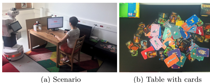
Fig. 1: (a) Scenario used in the experiment; (b) Table with cards used as a negative motivation.

Control: "Please complete the Stroop test on the computer. You have to answer as soon as possible, your score will be measured with respect to the